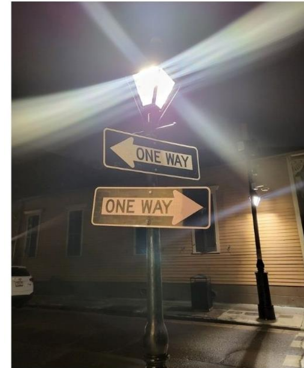
Bourbon & Barracks