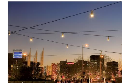
VCC Approved Alley Lights